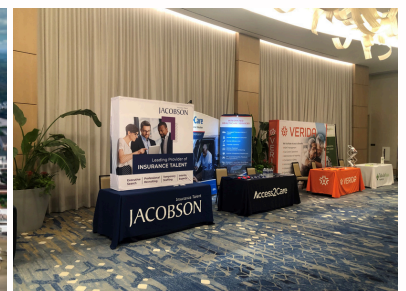
The Marriott Virginia Beach Oceanfront was the site of VAHP's 2023 Annual Meeting.